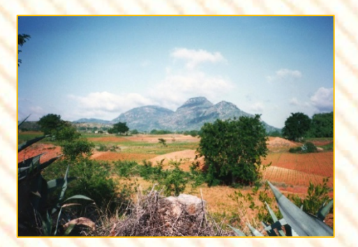
Another adventure - South India