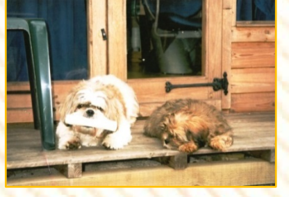
"Be your little dawg..."